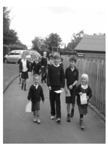
raised, primarily for further development of the wildlife area but also to purchase some new reading books.

The School would like to say a big thank you to everyone who has supported the event; so far a total of £653.50 has been