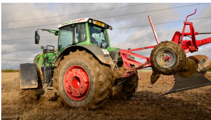
The deep plough arriving at Home Farm

The project uses an innovative technique of ground preparation called top soil inversion. This involves reversing the soil profile leaving the subsoil on the surface. Young trees establish better in ground prepared in this way because there is little weed competition and the open soil structure encourages rooting down into the fertile soil below. Conditions are also ideal for establishing wild flowers around the trees as they grow.