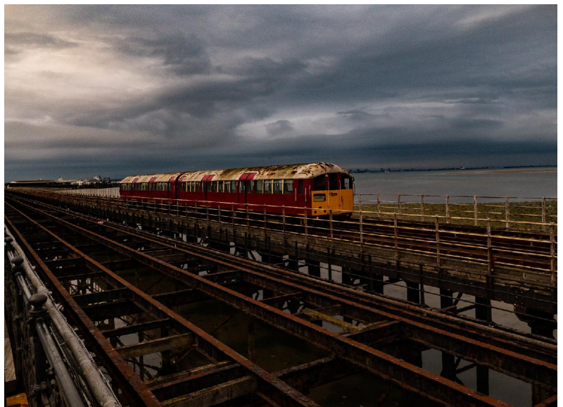
Martyn Pegler - End of Pier Train