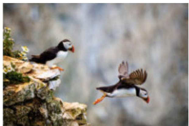
Jump Off - Kamal Antoun