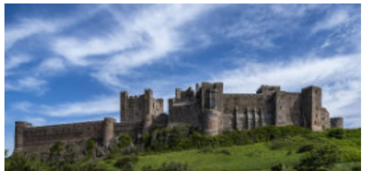
Bamburgh Castle