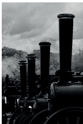
Traction - Selwyn Roberts