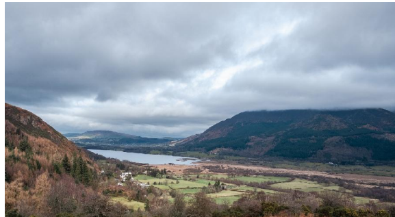
Basenthwaite Lake - Martyn Pegler